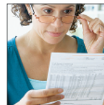
See your 5% cash back on your checking statement.

Name: Nur Yalcindag Email: nur.yalcindag@citi.com