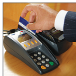
Swipe your card and choose “credit.”

Using your debit card for purchases is a great way to manage your finances – it's more convenient than checks and safer than cash. And when you sign for those purchases, it's more rewarding, too.