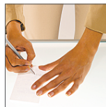
Sign for your purchases.